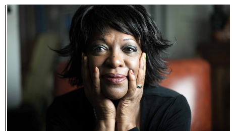
Rita Dove: the exact Grace

The thin line of verses moves through this polyphony of grace and form, independence, opposition and soft sinuosity of spells, which are absorbed by the dance, from the face and gestures. The gesture of the dance is proportional to the poetic gesture, following both the dance of things, which are modeled in the air of «achieved flight» and «that swift and serene / magnificence, / before the earth / remembered who we were / and brought us down».