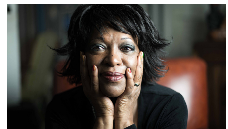
Rita Dove: the exact Grace

The violence of the trauma («Who can tell / what penetrates?»), the shutdown of the dark, lost brilliance that becomes the phrase-abuse and terrified gloss of dark sheen («It was as if / I had been traveling all these years / without a body, / until his hands found me - / and then there was just/ the two of us forever: / one who wounded / and one who served»), change of points of view, Persephone's estrangement, in her footfall that hovers pass the Demeter